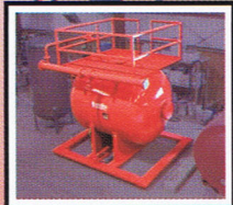
Custom Bladder Tank