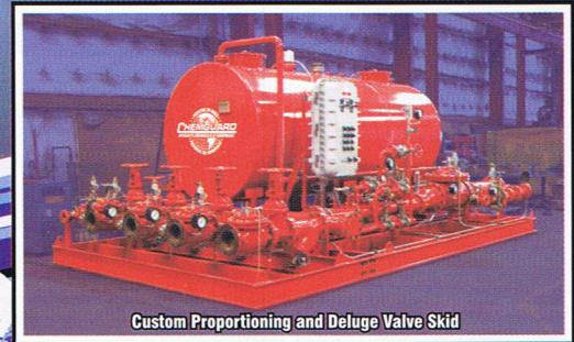
Custom Proportioning and Deluge Valve Skid