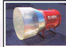
2500CFM Water Powered High Expansion Foam Generator