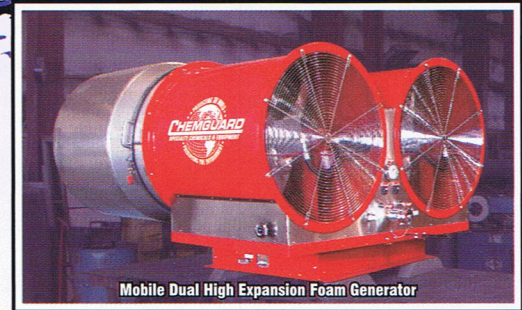
Mobile Dual High Expansion Foam Generator